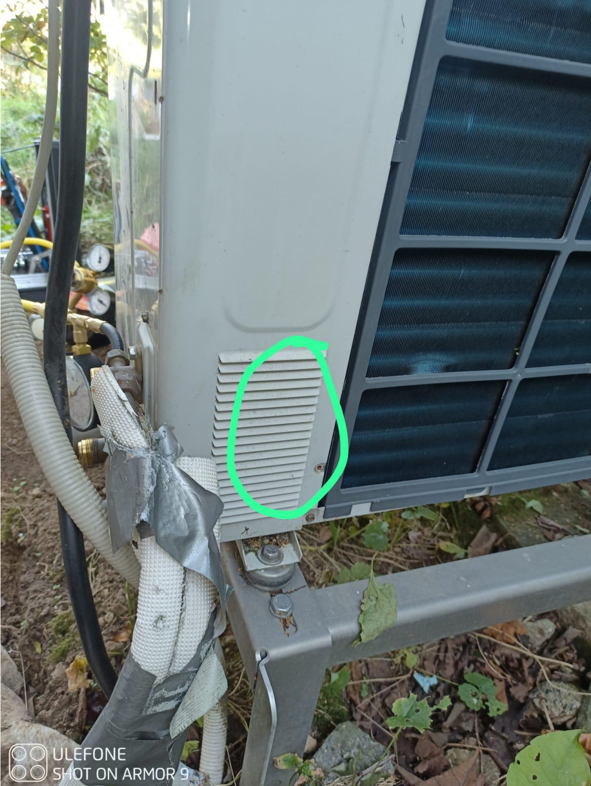
Undichtigkeit am WT der Außeneinheit im Kältekreis